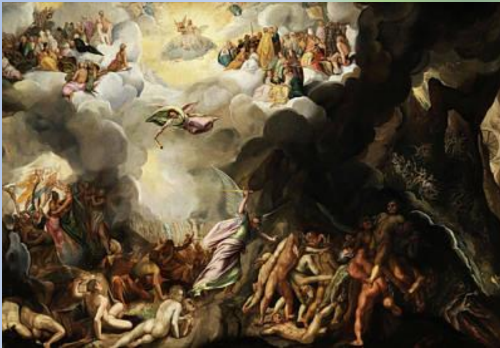
The Last Judgement by a Dutch artist from the 1600s

When people depend on evil to protect and enrich them they end up being ensnared in that evil. But even in the midst of such evil God offers grace through Jesus Christ.