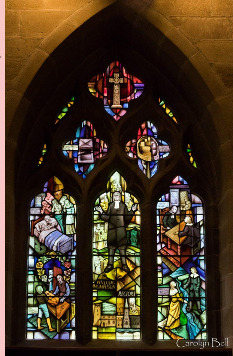
Plague Window in the St. Lawrence Eyam Parish church

Paul in Romans 8 brings home to us the importance of the belief in the resurrection that drives our Christian ethic. We believe fervently in the hope of the resurrection because the Holy within us makes the resurrected Jesus Christ’s presence real in our heart. As a result this mortal life is not as important as the calling and purpose of Jesus Christ within us.