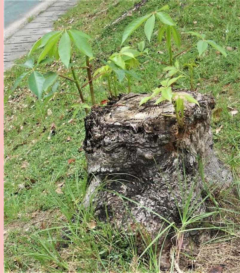
Life in a stump

Daniel at least 100 years after Isaiah’s prophecy would under God’s direction offer hope to the Babylonian King Nebuchadnezzar as he faced the judgement of God for his arrogance. Daniel promises in his interpretation of Nebuchadnezzar’s dream that even though the king will experience judgement he will also receive grace and restoration.