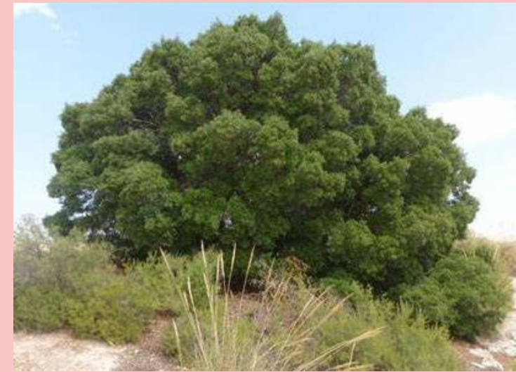
Palestine or Kermes Oak