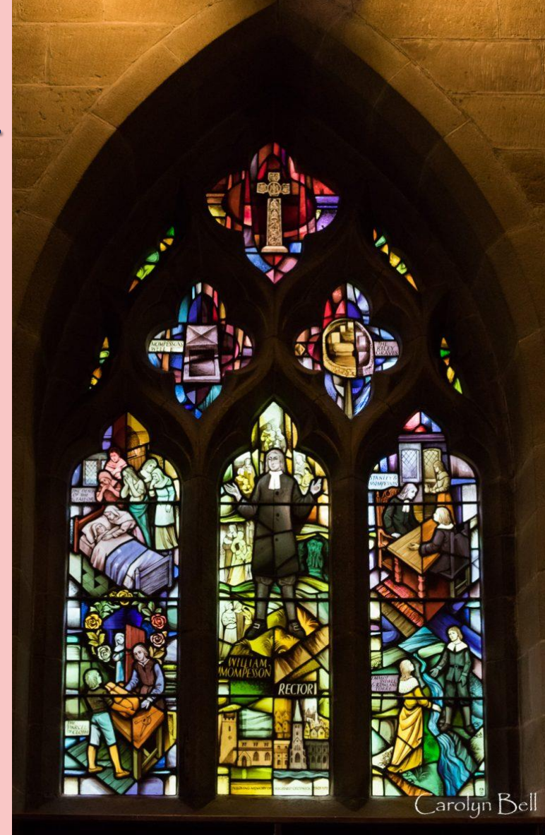
Plague Window in the St. Lawrence Eyam Parish church